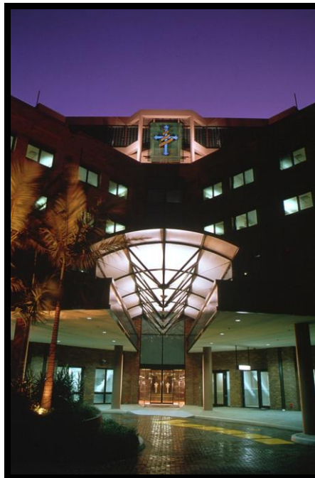
Mater Private Hospital

Many more apartments are available and can be found on Brisbane Accommodation .